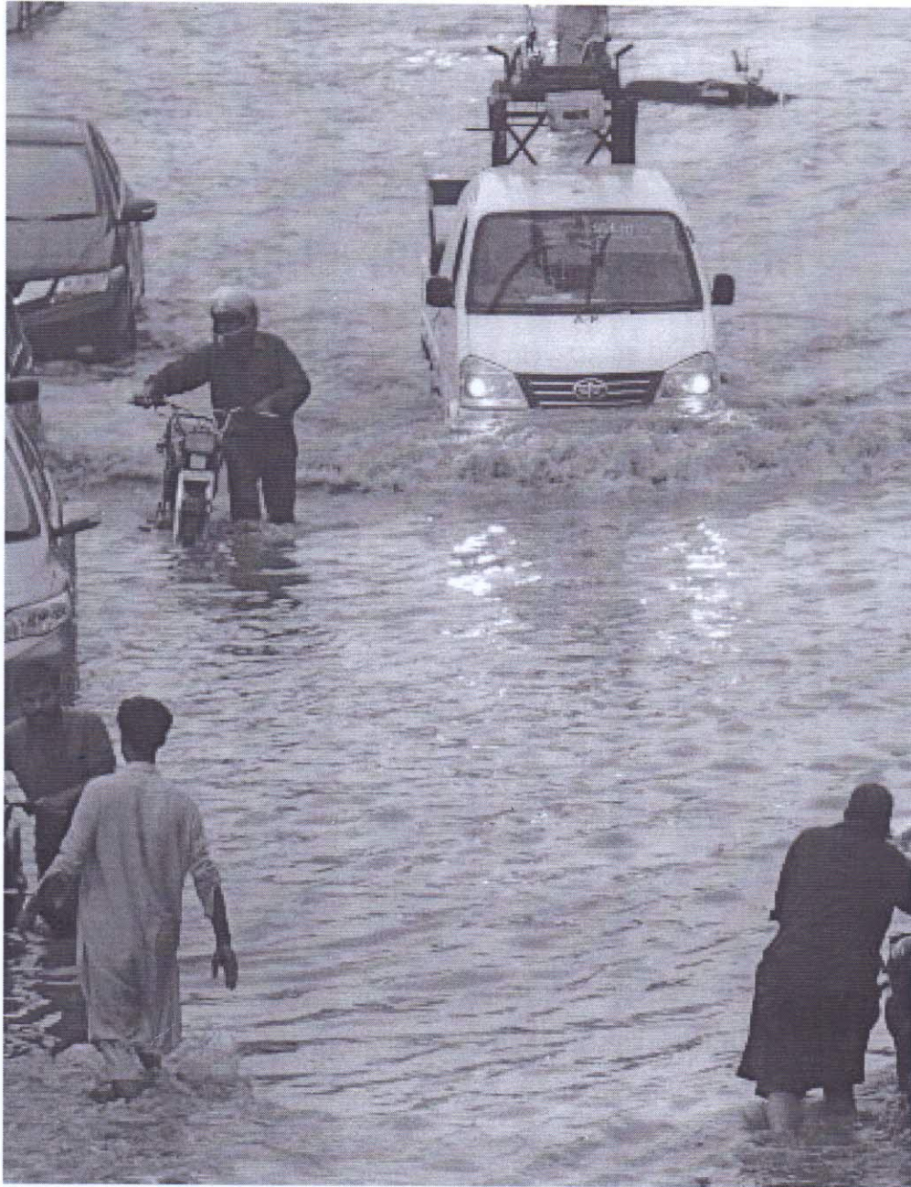
People wade through a flooded road caused by heavy rainfall in Karachi on Friday, July 17.