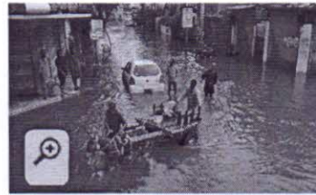
A man pushes a donkey cart through a flooded street caused by heavy rainfall in Karachi on Friday.