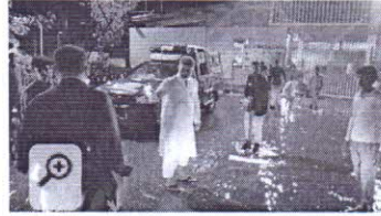
A police team drains rainwater outside JPMC.

Special attention was being paid to maintain the flow of traffic through underpasses, he said.